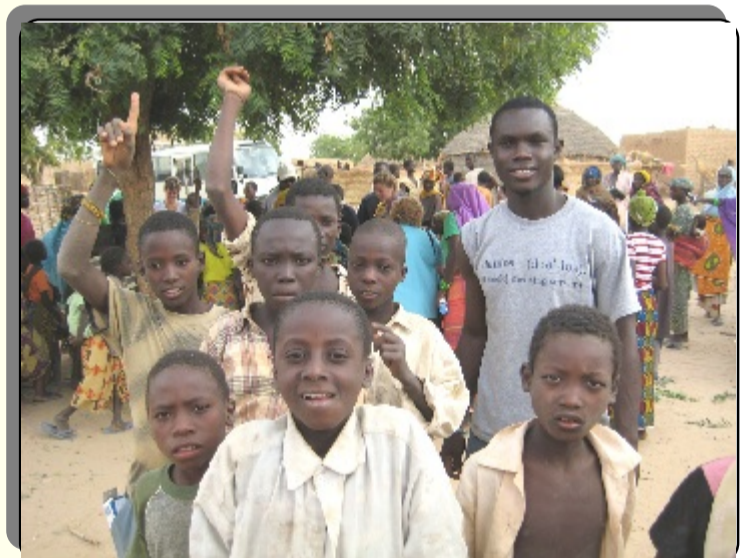
Praise God for provisions in Jesus' name!